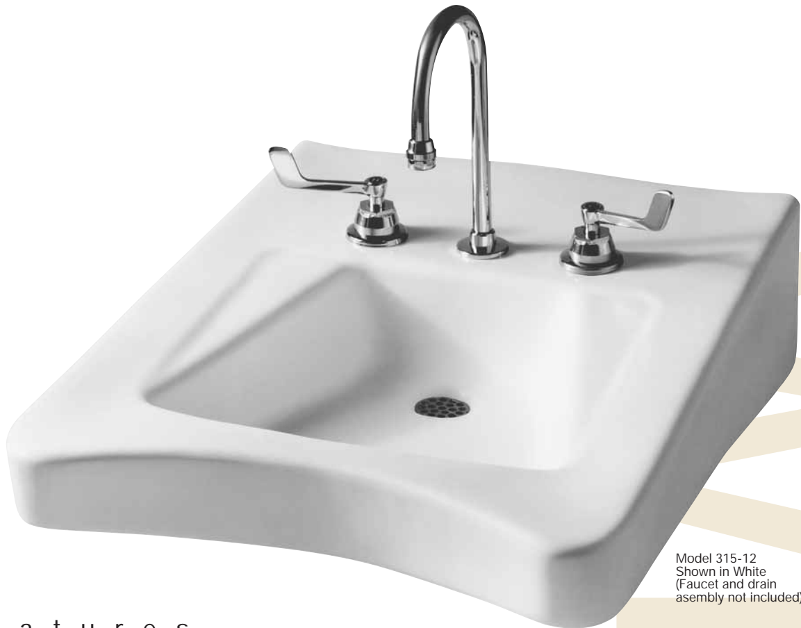
Model 315-12 Shown in White (Faucet and drain assembly not included)

Wall-Mount, ADA Compliant, Vitreous China Lavatory